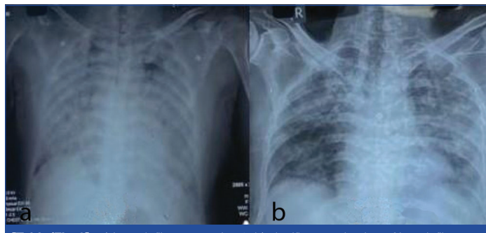
[Table/Fig-3]: a) Lung infiltrates on day 1; b) significant reduction of lung infiltrates on day 3 in chest radiograph.